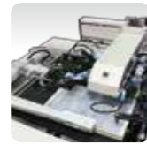
handling and printing of thin film substrates: feeding from pile and unloading by adjustable suction cups

- total system accuracy: \pm 10 \mu\text{m} / \pm 0.4 \text{ mil}