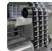
EPC guide web rolling alignment Air shaft to hold firmly the material roll Servo motor with load-cell to control web tension

Note : RR2550/C & RR3250/C with CCD - camera - registration and auto - alignment RR5060/S with sensor - registration and auto - alignment