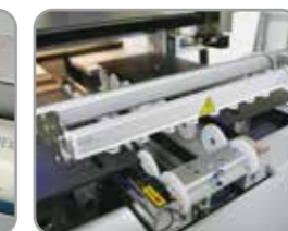
anti-static discharge bar