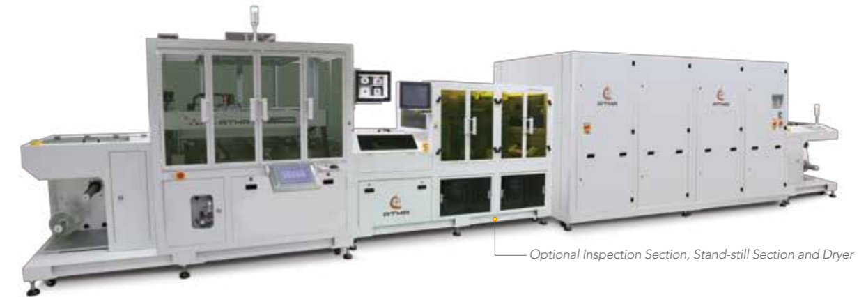
Optional Inspection Section, Stand-still Section and Dryer