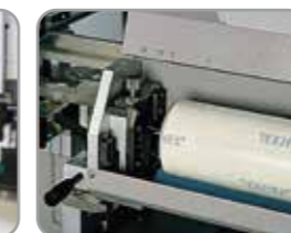
substrate cleaning roller